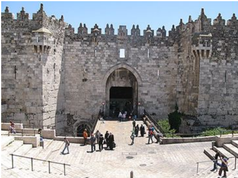
Damascus Gate Jerusalem

We will go along according to your point of interest