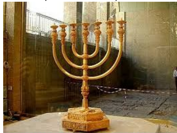
Golden Menorah in the Jewish Quarter

Enter the Jewish Quarter: Visit the restored Byzantine Cardo; the 'Wide Wall' of King Hezekiah; see the restored Hurva Synagogue, descend & past the Compound of the Hospitaller Knight's compound & church for a