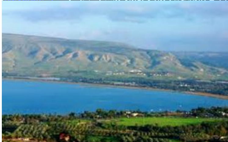
Sea of Galilee