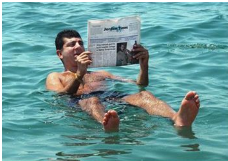
Floating on the Dead Sea

Monday, 03 June 2013 17:06 - Last Updated Monday, 11 February 2019 19:01